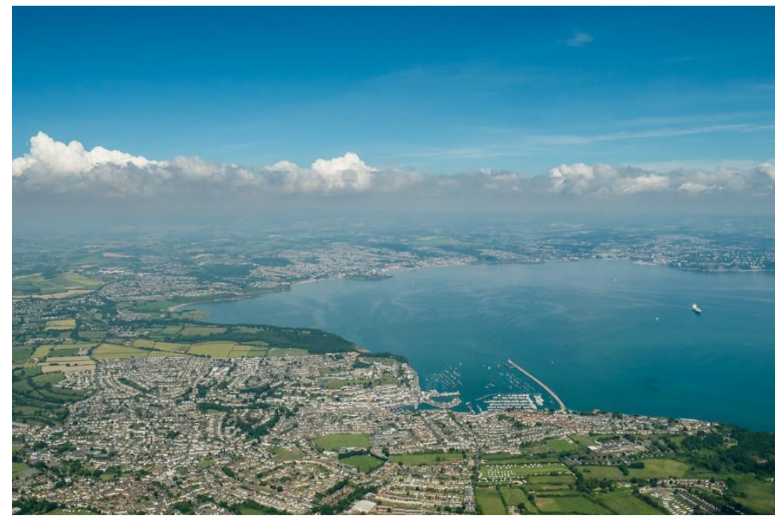
Tor Bay: Looking north from Brixham to Paignton (top centre) and Torquay (top right)