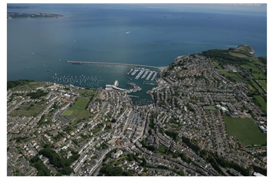
The town of Brixham: "Fishtown" to the left and centre, with "Cowtown" on the right

This ward encompasses the heart of Brixham and its famous fishing port. The history of Brixham goes back over 1,000 years and its role as a fishing port is even mentioned in the Doomsday Book. Unlike many other ports across the UK, the Brixham fishing industry is largely based on sustainable stocks and has therefore thrived in recent years – so much so that it now returns the highest value catch in England and has a world class reputation for quality.