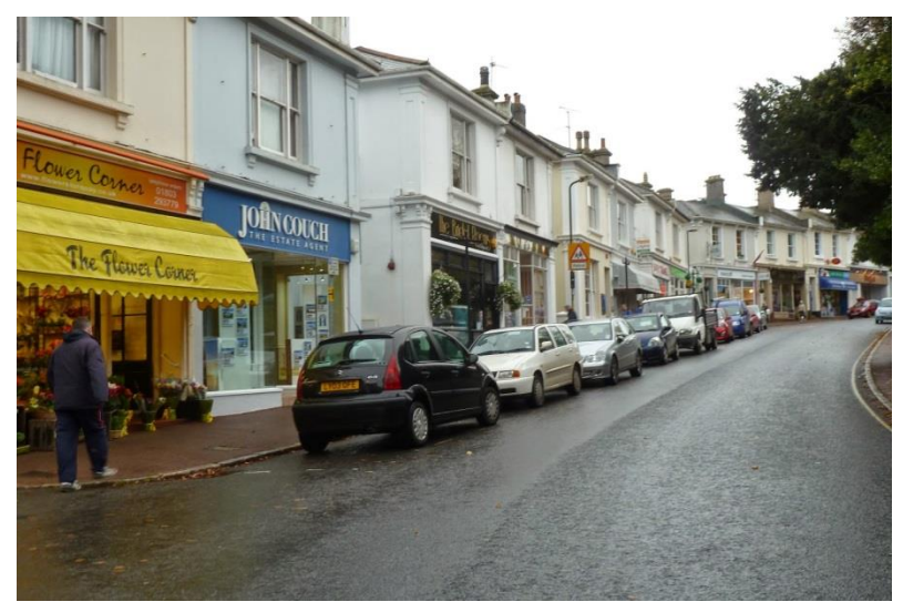
The boutique shops of Ilsham Road, Wellswood

Importing voters into Wellswood is not particularly feasible when it is bound on two sides out of four by the coastline, and otherwise primarily by the existing Ellacombe and St. Marychurch wards, both of which are very tight-knit communities in their own right with their very own distinctive characteristics, history and identity. Given their own very unique communities, neither the voters of the Ellacombe nor the St. Marychurch ward readily associate themselves with Wellswood and, for example, the inhabitants of neither will regularly shop in Wellswood. Notwithstanding the fact that retail boutique outlets in Wellswood are far more expensive than an average high street, the people in St. Marychurch have their very prosperous shopping precinct, the Waitrose superstore in Plainmoor and popular parades of shops in Babbacombe. Ellacombe has few shops, but its residents are in any event largely within very easy reach of the town centre and naturally shop here or in Plainmoor, not Wellswood.