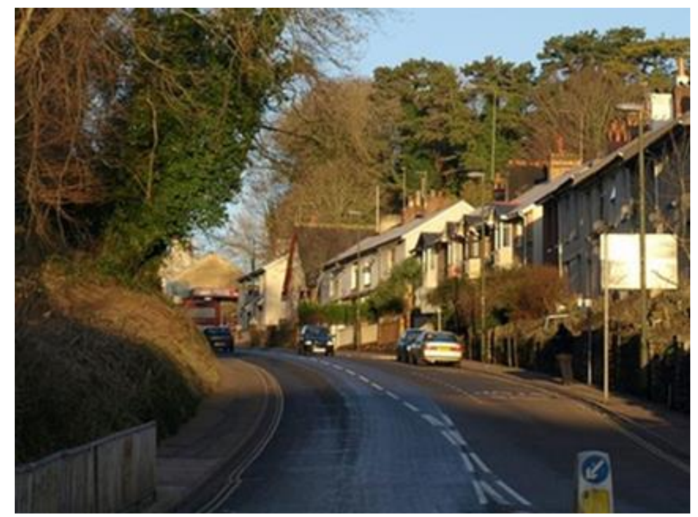
Hele Village – The proposals will reunify this in a single ward

Finally, as a further means of bringing together the residents of the Hele community, it is proposed to import from the prevailing Shiphay-with-The Willows Polling District TA all the voters on Hele Road from its junction with Barton Hill Road and its junction with Riviera Way. The result of this transfer will finally bring all the residents of the B3199 Hele Road into one ward where the residents' concerns can be addressed by a single point of electoral contact.