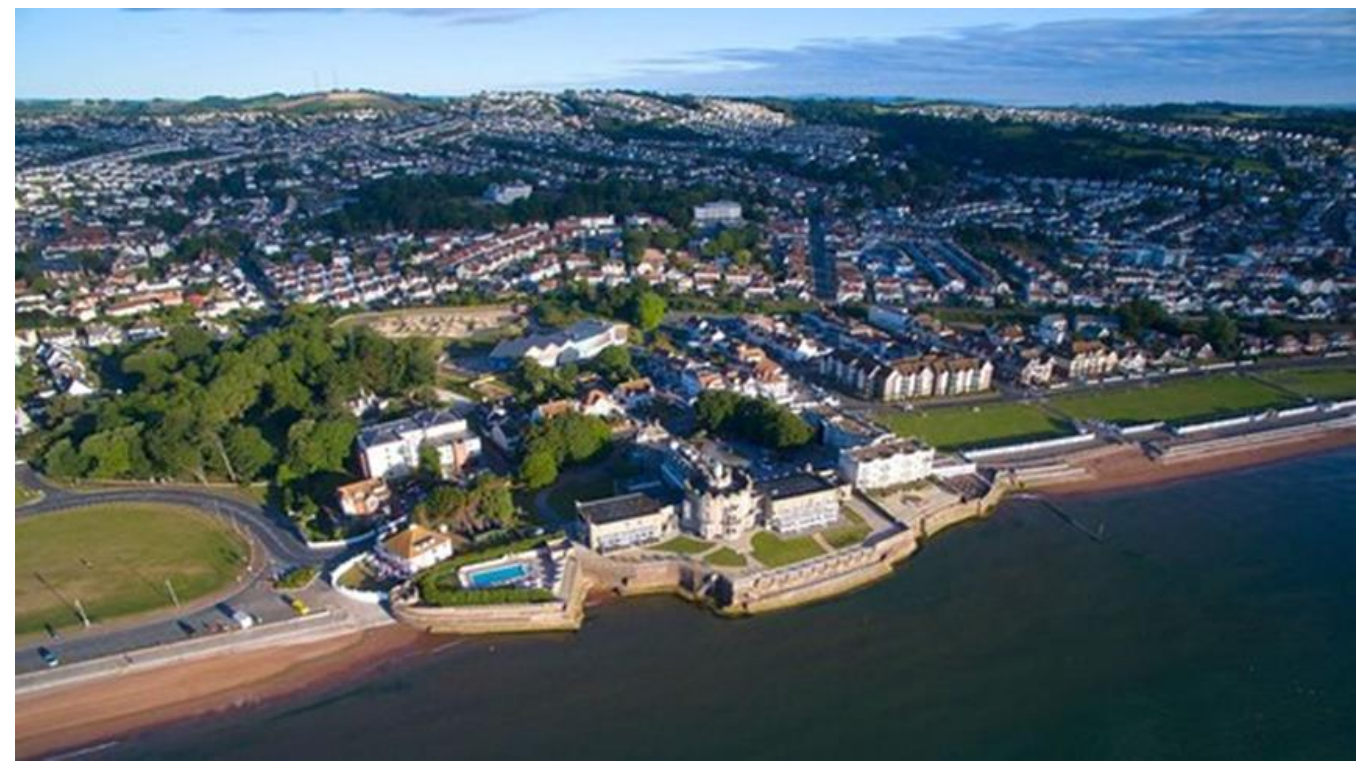
Looking west, the current Preston Ward, with Shorton and Preston Down on the high ground

The proposed creation of a three-member ward encompassing both the eastern end of the current Preston ward and Paignton town centre will also bring other communal benefits. For instance, both the current Roundham-with-Hyde ward and the area of lower Preston to be merged with this have a common interest in the two main commuter routes and arterial roads linking Torquay with Paignton town centres, namely the A3022 and the B3021.