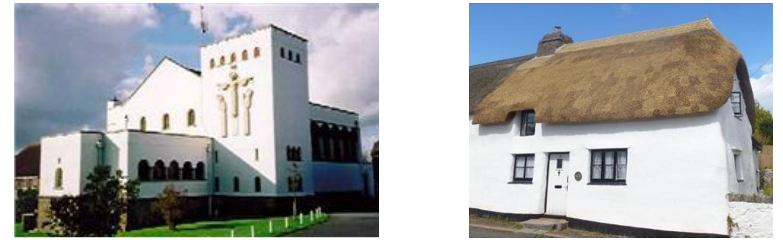
St. Martin's church, Barton and a cottage in Fore, Street, Barton (currently in the Shiphay-with-The Willows and Watcombe wards respectively)

In a similar vein, however, many of the residents on the eastern fringes of the Shiphay-with-The Willows ward live on Barton Hill Road and will more readily associate themselves with the nearby historical Barton community, the spiritual home of which around Fore Street in Barton currently falls within the bounds of the Watcombe ward. It is therefore proposed that the residents here be transferred to the existing Watcombe ward. Such a move will re-unite St. Martin's church in Barton and the immediate neighbourhood with other Barton residents under a single point of electoral accountability.