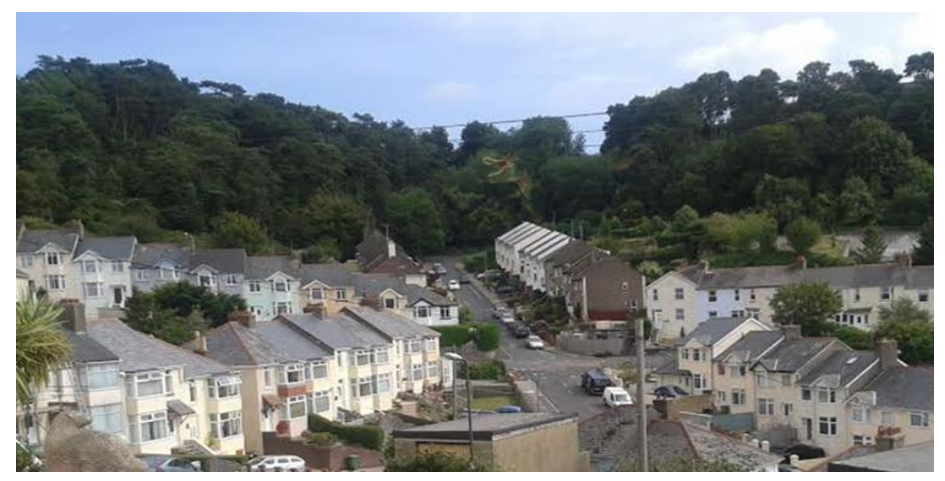
The Ellacombe Valley, with the Warberry Copse separating this from Wellswood

As with certain other districts of Torquay, the district of Ellacombe has a proud and distinct history of its own, which has given rise over time to its very own community. Nestled in what was originally the Combe of Ellacombe containing Ellacombe Farm, the area has developed as a single close-knit community since the mid nineteenth century. In essence, Ellacombe is bounded on three sides by hills and on one side by the town centre. The ward is very compact and primarily residential in nature.