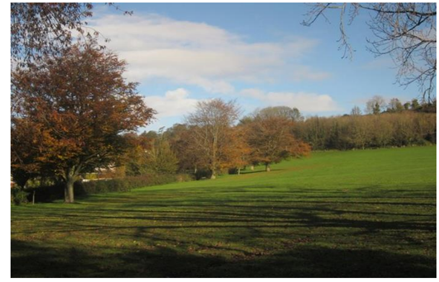
King George V Playing Fields, with Torquay Golf Club a natural boundary between Watcombe and St. Marychurch

It is further proposed that all the residents living in Lummaton Place, Grasmere Close, Bigbury Way, Pavor Road and Fore Street, Barton (as opposed to the similarly named Fore Street in St. Marychurch itself), as well as those living at 386-400 Teignmouth Road (TQ1 4SW) be transferred to the Watcombe ward. Such a move would unify all the residents living along the entire length of the historical route that is Fore Street Barton – and the roads leading off this, into one single ward.