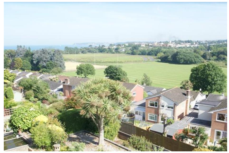
Looking south across Clennon Valley, a natural geographical feature separating Goodrington (top right) from Paignton

For instance, in the current Polling District ID, the residents of the York Road and Elsdale Road vicinity have always considered themselves to be part of the St. Michael's community which is almost exclusively located at present within the current Roundham-with-Hyde ward. Indeed, residents of the York Road neighbourhood are regular attendees at meetings convened by the St. Michael's Residents Association. The residential area of St. Michael's in Paignton is essentially one stretch of highway running through a natural valley to the west of the town centre. It was overwhelmingly constructed at the same time and comprises St. Michael's Road and Hayes Road with a plethora of streets akin to a ribcage off this of which York Road is just one example.