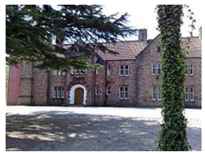
Shiphay Manor ... but at present in the Cockington-with-Chelston ward

It is additionally proposed that the electorate currently within the bounds of the Cockington-with-Chelston Polling District BD be transferred to an expanded Shiphay-with-The Willows ward, with the exception of those living in Sherwell Valley Road, Drake Avenue and Frobisher Green. With regard to those few registered voters with the post code TQ3 1SU and living in the rural outposts of the Stantor area of Polling District BD, it is proposed that they be transferred internally to Polling District BE by means of a re-aligned boundary stretching from Armada Park westwards to the Gallows Gate roundabout on the A380.