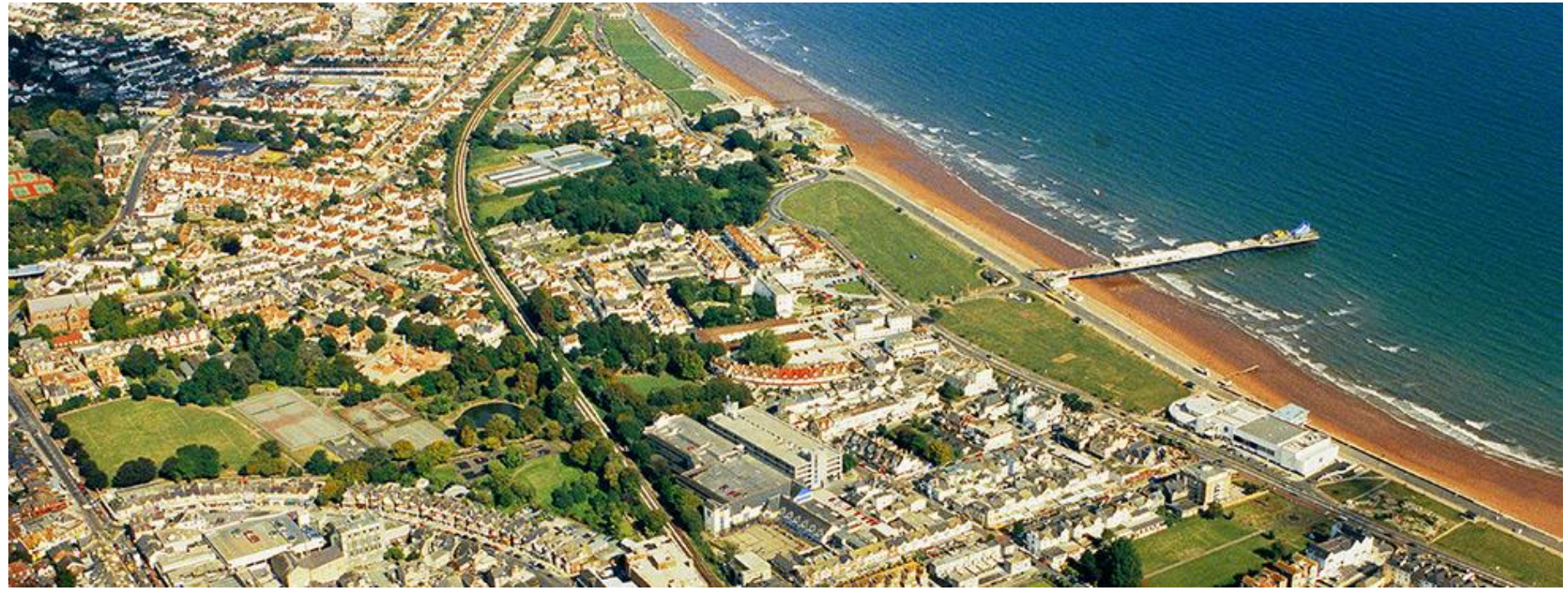
Looking north, the railway from Torquay cuts through the geographical plateau containing Paignton town centre

Paignton town centre faces unique problems that will need resolving in the coming years – the regeneration of both Victoria Square and Station Square, the future of both the Crossways Shopping Centre and the Grade II listed Oldway Mansion, as well as the prospect of a restructure of local schools (the Parkfield and Mayfield sites) are all unavoidably interwoven and therefore best served from a single point of accountability.